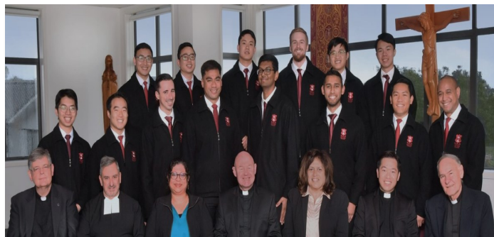
HOLY CROSS SEMINARY 2024