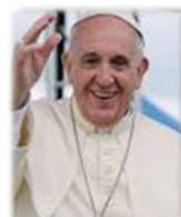
Pope Francis, Homily , Ascension, 9 May

'Let us lift up our hearts to Christ, and become singers of hope in a culture marked by much despair. By our actions, our words, the decisions we make each day, our patient efforts to sow seeds of beauty and kindness wherever we find ourselves, we want to sing of hope, so that its melody can touch the heartstrings of humanity'