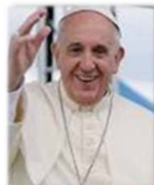
Pope Francis, Angelus, 25 Oct 2020

"Love for God is expressed above all in prayer, particularly in adoration. Adoring God is precisely the heart of prayer. And love for neighbour, which is also called fraternal charity, consists in closeness, listening, sharing, caring for others. And so often we neglect to listen to others because it is boring or because it takes up our time, or [we neglect] to accompany them, to support them in their suffering, in their trials...."