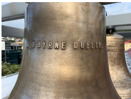
Refurbished Cathedral bells

St. Thomas More Church 30A Worcester St. Wilton 4 May to 15 June 2022 7 consecutive Wednesdays A kohe will be taken each week 7:30PM to 9:00PM To inquire/register: cathedral.parish@wn.catholic.org.nz