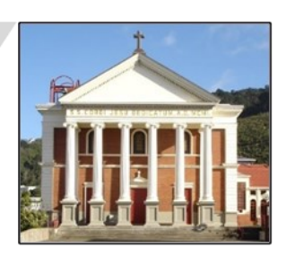
17 April 2022 Vol. 11 Issue 12 Easter Sunday