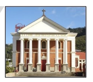
13 March 2022 Vol. 11 Issue 7 2nd Sunday of Lent