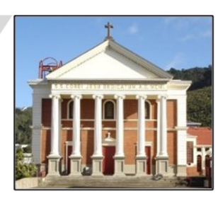
06 February 2022 Vol. 11 Issue 2 5thSunday in Ordinary Time