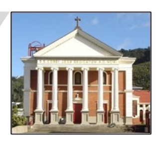
19 December 202 Vol. 10 Issue 47 Fourth Sunday in Advent