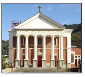
19 September 202 Vol. 10 Issue 34 Twenty-fifth Sunday in Ordinary Time