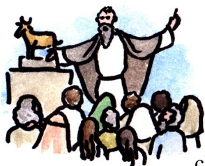
Joshua 24:1-2, 15-18

In today's first reading, Joshua told the people that they had to choose between the false gods and the true God. Joshua and the people chose to worship the true God.