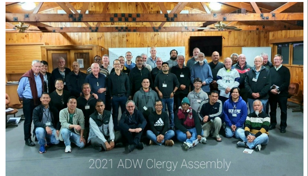
2021 ADW Clergy Assembly

On Wednesday we celebrated one of the great traditions in our Archdiocese - the Annual Jubilee Mass for priests who have celebrated significant milestones in their priestly ministry – 14 priests celebrating 690 years of priestly and episcopal ministry.