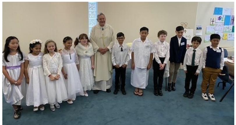
Congratulations and blessings to the children who received their First Holy Communion at our 10.30am Mass last Sunday.